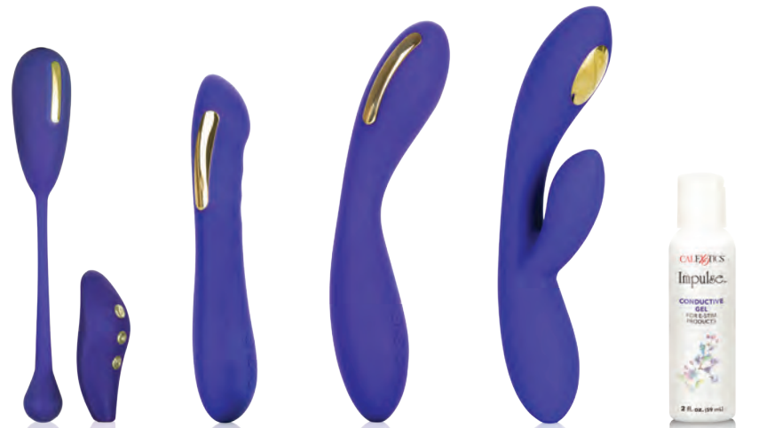
INTIMATE E-STIMULATOR REMOTE KEGEL EXERCISER SE-0630-05-3